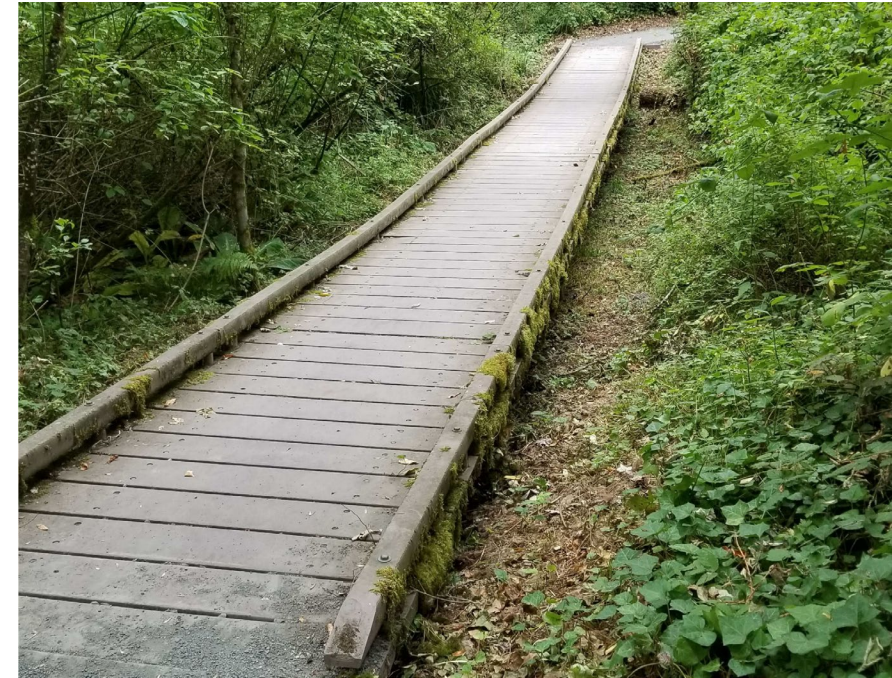
Boardwalk, Browns Ferry Park