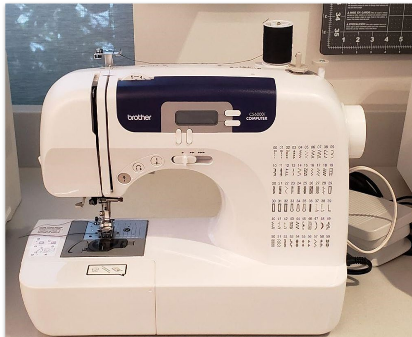
Sewing Machines and Serger