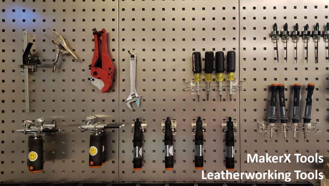
MakerX Tools Leatherworking Tools