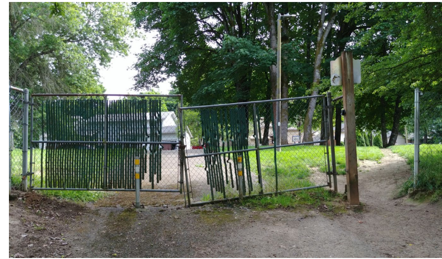
Fence, Stone Ridge Park

www.tualatinoregon.gov/recreation/parks-utility-fee